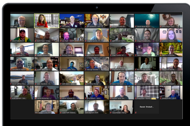
COALITION CLASS 2020

The Operations Academy is a two-week, total immersion transportation management and operations program. It was developed in response to the increasing demand for personnel with skills in these areas. The program uses a mix of classroom instruction, workshops, and analysis of existing systems to ensure the retention of the principles presented. It provides opportunities to practice and internalize the principles learned which is not possible in traditional classes and short courses. Each year, the Eastern Transportation Coalition provides funding for scholarships to candidates from each of our member agencies.